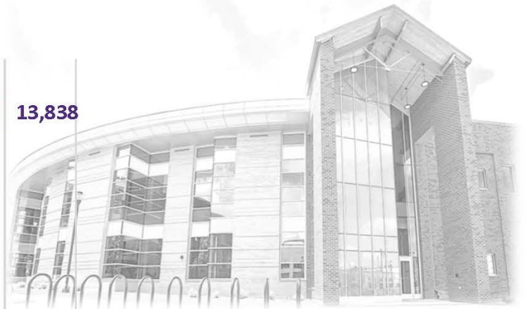
Campus Student Centers